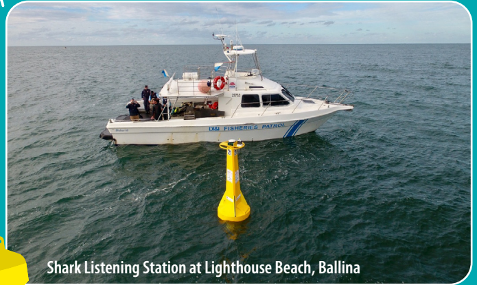
Shark Listening Station at Lighthouse Beach, Ballina